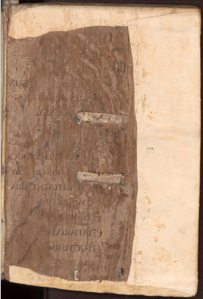
Figure 1: Montpellier, Bibliothèque Universitaire Historique de Médecine, Université de Montpellier, codex H 226, lower board.