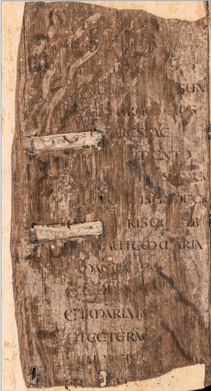
Figure 2, 3: detail of reproduction after postprocessing (mirroring and enhanced contrast)