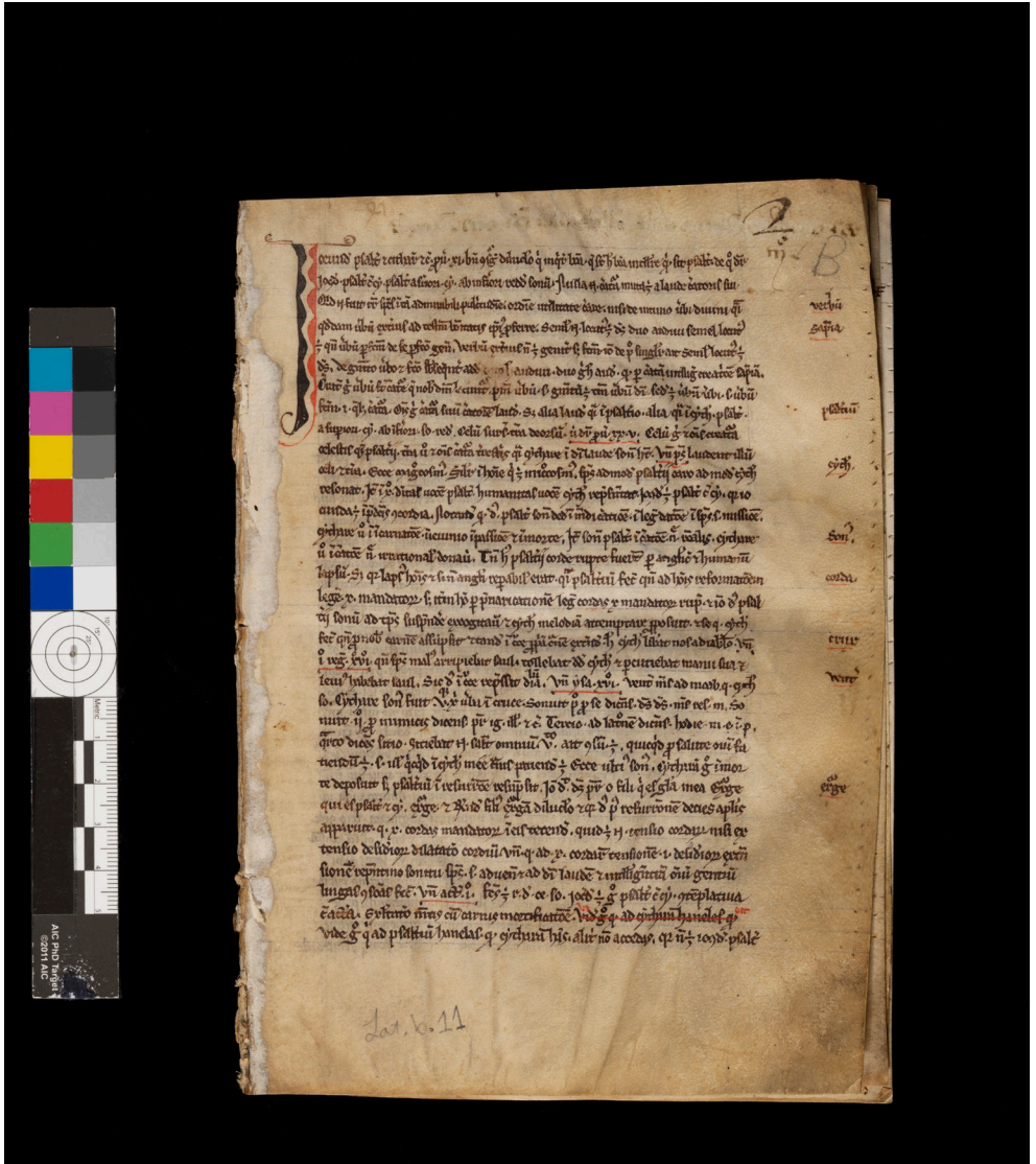
Figure 1: Erased ownership inscription in the upper margin of Philip the Chancellor's sermons on the Psalms. Notre Dame (IN), University of Notre Dame, Hesburgh Library, cod. Lat. b. 11, fol 11r